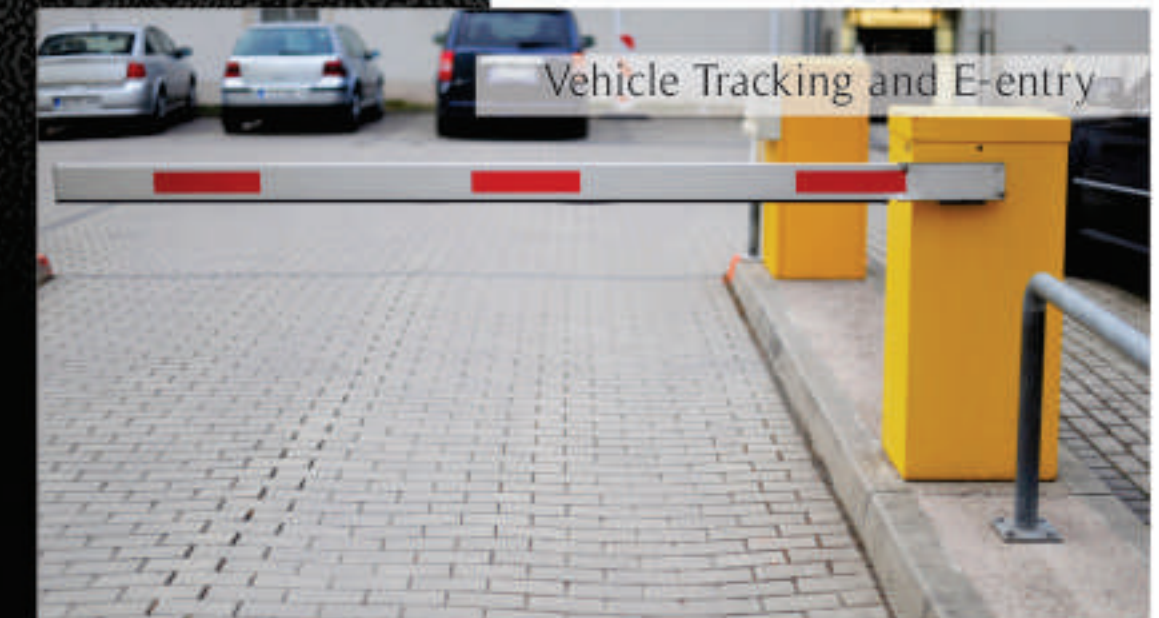
Vehicle Tracking and E-entry