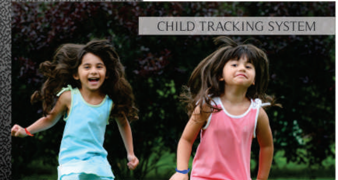
CHILD TRACKING SYSTEM