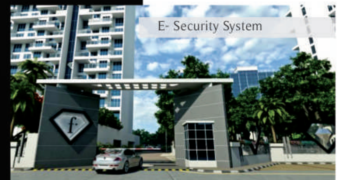
E- Security System