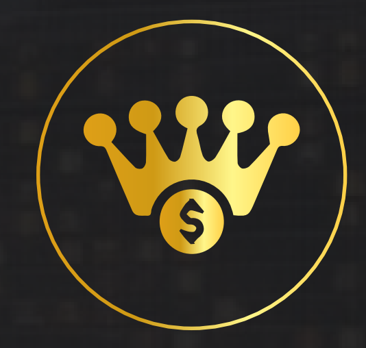
Royalty 3 % on Sales Assistance